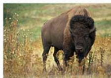
North American bison